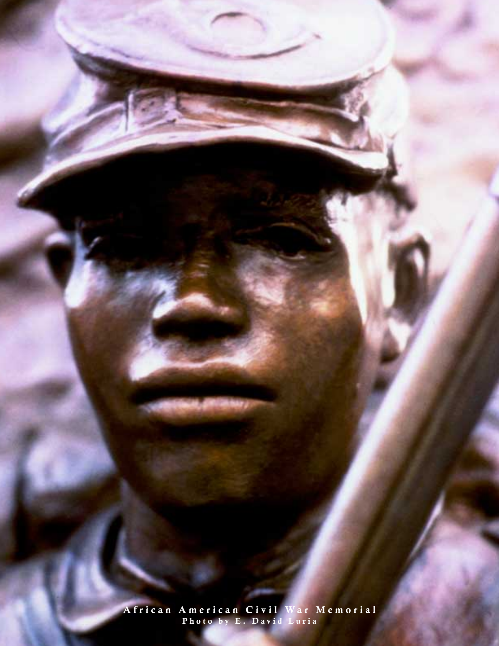
African American Civil War Memorial